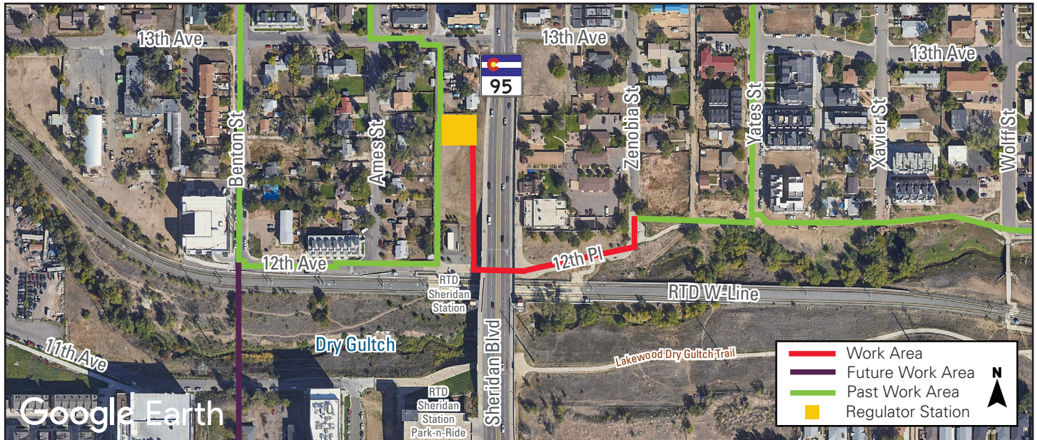
This map is a graphic and may not show exact locations.