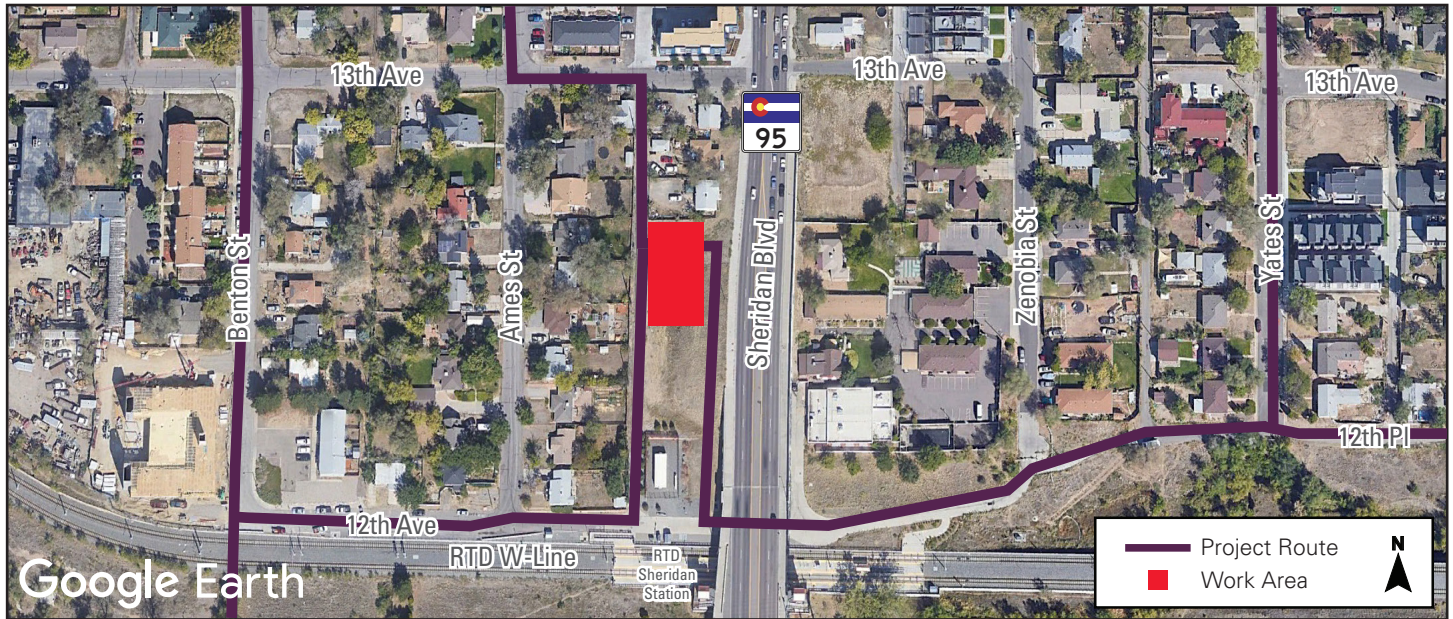
This map is a graphic and may not show exact locations.