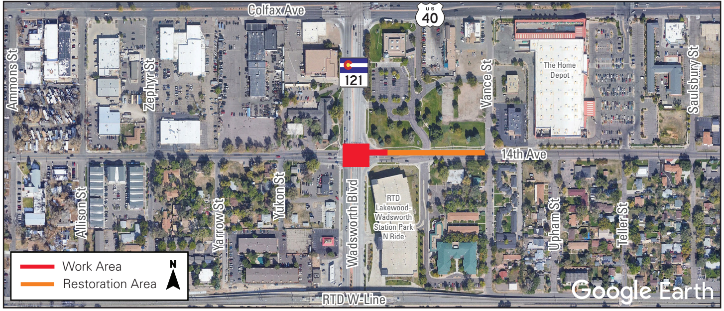
This map is a graphic and may not show exact locations