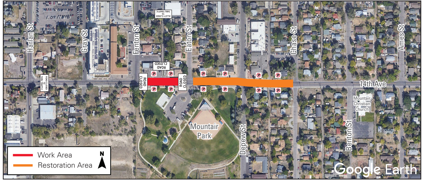
This map is a graphic and may not show exact locations